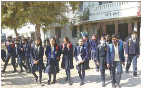
Students leave from school after attend for classes 6-8 to reopen due to coronavirus pandemic, in Patna.

The national highway widening projects, including the Varanasi-Jaunt 10 (part of Lucknow highway), Varanasi-Ghazipur and Varanasi-Azamgarh will complete in June and July, while the rail over bridge