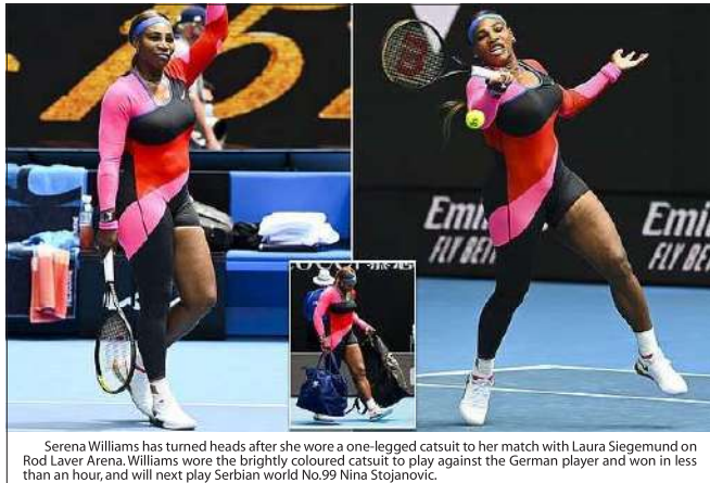
Serena Williams has turned heads after she wore a one-legged catsuit to her match with Laura Siegemund on Rod Laver Arena. Williams wore the brightly coloured catsuit to play against the German player and won in less than an hour, and will next play Serbian world No.99 Nina Stojanovic.

Excluding these two items, fiscal deficit could have been lower by 0.5-1.0 per cent in fiscal 2021 and 0.6 per cent in fiscal 2022, the rating agency's research report said. Talking about the impact of higher deficit on economy, the report suggests though a large fiscal deficit could be inflationary, spending and augurs well for jobs.