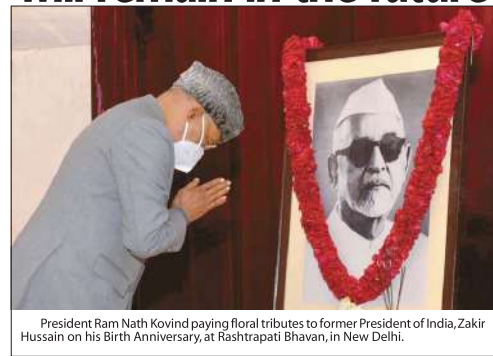
President Ram Nath Kovind paying floral tributes to former President of India, Zakir Hussain on his Birth Anniversary, at Rashtrapati Bhavan, in New Delhi.