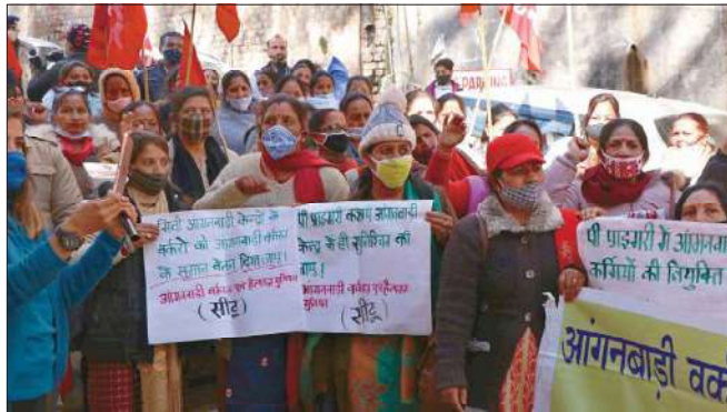
Anganwadi Workers protesting under the banner of CITU to press their demands, in Shimla.