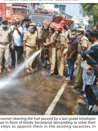
Police and Fireforce personnel cleaning the fuel poured by a last grade employee PSC rank holder to set ablaze in front of Kerala Secretariat demanding to solve their indefinite strike to take steps to appoint them in the existing vacancies, in Thiruvananthapuram.

New Delhi, Indian minister VK Singh's statement that India has transgressed the Line of Actual Control (LAC) more times than China is an "unwitting confession," the Chinese foreign ministry said on Monday. Singh, the transport and highway minister and former four-star general of the Indian Army, was quoted in Indian media on Sunday as saying that both countries had crossed their perceptions of the undemarcated LAC many times. "None of you come to know how many times we have transgressed as per our perception. Chinese media does not cover it," Singh was quoted as saying. "Let me assure you, if China has transgressed 10 times, we must have done it at least 50 times."