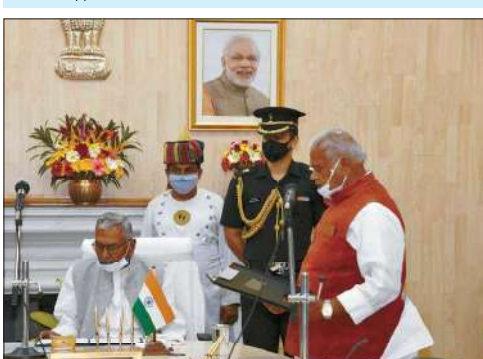
HAM Party president Jitanram Manjhi taking oath as pro-tem speaker of Bihar Assembly by Bihar Governor Phagu Chauhan at Raj Bhawan in Patna.

ficer on special duty for Covid-19 in Ahmedabad city. As per Gupta, out of 7,279 beds made available for COVID-19 patients in seven government and 76 designated private hospitals, 2,848 beds, that is 40 per cent, are still available. These include 2,347 beds in government hospitals and 501 beds in designated private hospitals. Ahmedabad district in Gujarat reported 220 new coronavirus cases on Wednesday, taking its tally to 46,022, the state health department said. With five more deaths, the fatalities in the district rose to 1,949, the department said.