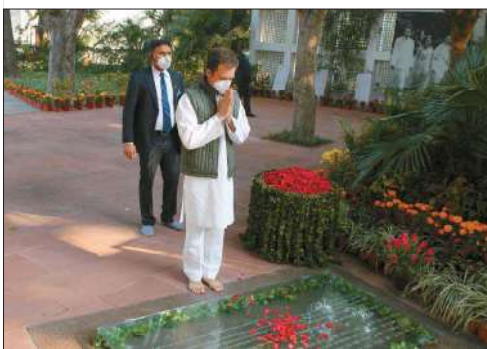
Congress leader Rahul Gandhi offering floral tributes to former Prime Minister Indira Gandhi on her birth anniversary at Indira Gandhi Memorial, in New Delhi.

The Chief Minister has directed the animal husbandry department to carry out an immunization drive against diseases and it should be ensured that veterinarians visit shelters regularly.