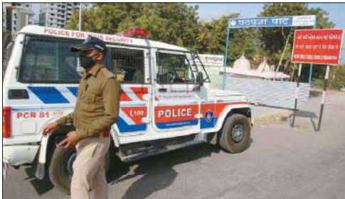
ઉત્તરપ્રદેશથીઓ દ્વારા ઉપવાસ છઠ્ઠી પૂજાને કોરોના મહામારીને લઈને બંધ રાખવામાં આવતા હિંદુ ડિયા ક્રિયા માટેના અભય દ્વારે લોકોને એકઠા થતા રોકવા પોલીસ બંદોબસ્ત ગોઠવ્યો હતો