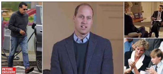
The Duke of Cambridge (middle) last night called Lord Dyon's independent investigation into whether Martin Bashir (left) conned his mother into their notorious 1995 Panorama interview (top right) 'a step in the right direction'. William, who was a teenager when the interview took place, today said: 'The independent investigation is a step in the right direction. It should help establish the truth behind the actions that led to the Panorama interview and subsequent decisions taken by those in the BBC at the time.' The BBC yesterday appointed one of Britain's most decorated judges to lead a probe into allegations of forgery, deceit and cover-up surrounding Mr Bashir's interview with Princess Diana. Meanwhile Mr Bashir - who has been unable to be asked any questions by the BBC about the Diana claims because of his ill health but is expected to take part in Lord Dyon's inquiry - was pictured looking 'fit and well' as he charged up his electric-powered Mercedes after fleeing London. Princess right is Diana with a young Prince William.

During the 2020 presidential election, Republicans flipped nearly a dozen seats with several party candidates leading in uncalled races, said a The Hill report.