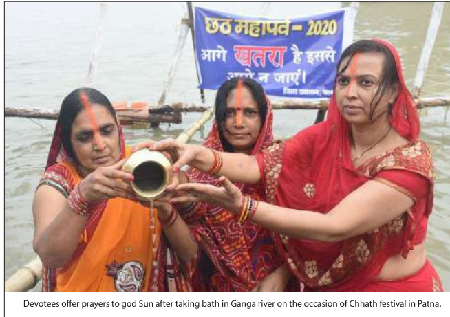
Devotees offer prayers to god Sun after taking bath in Ganga river on the occasion of Chhath festival in Patna.