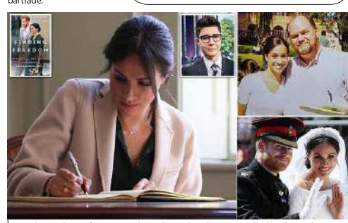
The Duchess of Sussex, 39, has admitted in documents filed at the High Court that she provided personal information to the authors of the book 'Finding Freedom' via a third party who she had been approached by its authors. Meghan's lawyers reveal that she was concerned about her father Thomas Markle's narrative in the media (pictured together, right) that she had 'abandoned him' and 'had not even tried to contact him (which was false) would be repeated'. To prevent any further misrepresentation, she admitted that she had communicated the 'true position' of her relationship with her father to a person who had been approached by the authors, but insists in the document that she does not know if information was shared. Pictured: Meghan signing a visitors book in 2018 (left); Prince Harry and Meghan on their wedding day, May 19, 2018 (inset).

"So I just want to tell you that that's the only slowdown right now that we have."